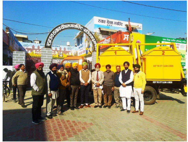
Preventive Healthcare & Sanitation : Health Camps and Twin Dumper Placer provided for cleanliness