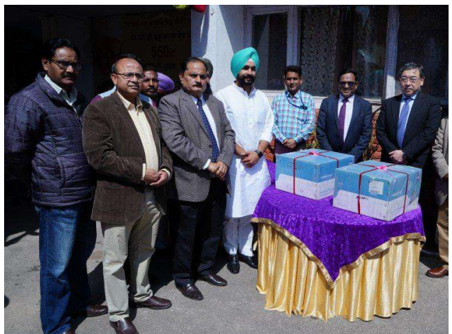
Healthcare – Ambulance and Medical Infrastructure in Government Hospitals