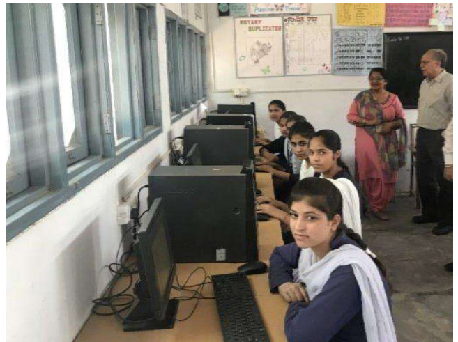
Vocational training Projects for economically backward section of society