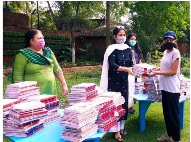
Education - Support to under privileged girls in the form of Fees, Uniforms & Books