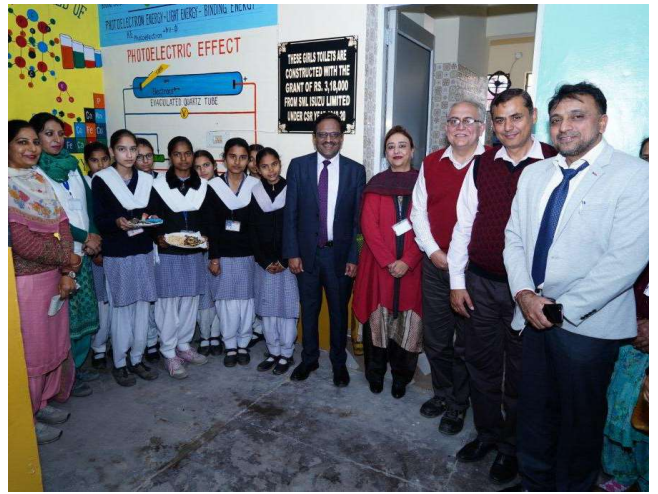
Education - School infrastructure up-gradation Projects: Dual Desks, Green Boards and Toilets in village Schools